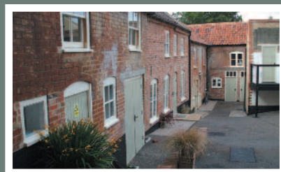
Miles Ward Court in Halesworth

This flexible workspace is an ideal first step and we have a couple of units available for rent soon.